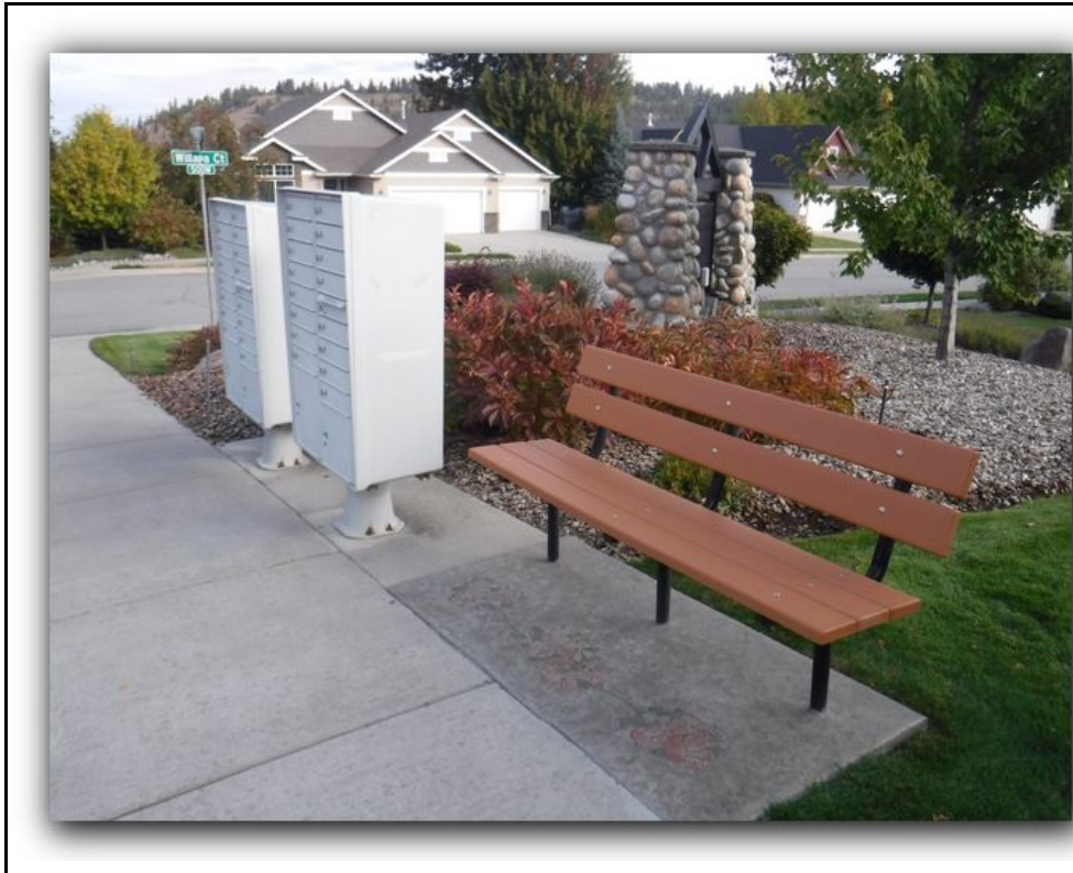
Photo Number 5 Description: Mailboxes and park bench at monument area